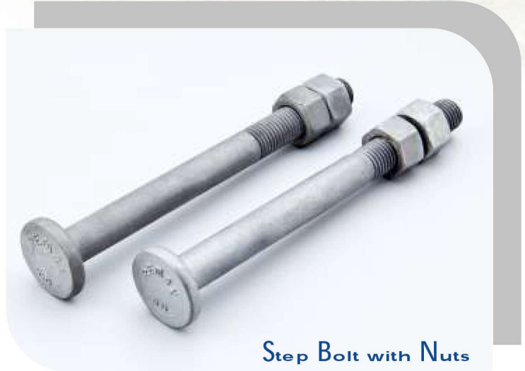
Step Bolt with Nuts