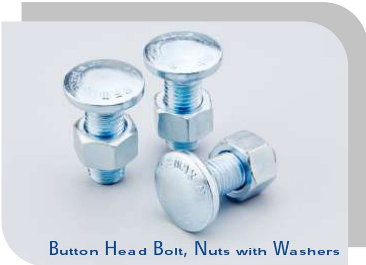
Button Head Bolt, Nuts with Washers