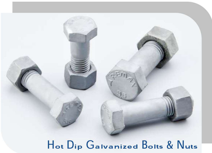
Hot Dip Galvanized Bolts & Nuts