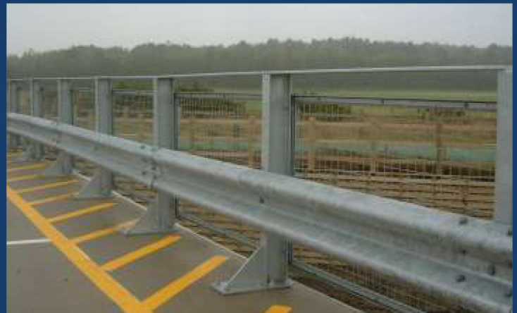
ROAD CRASH BARRIERS

All Type of Fasteners Manufacturing under one roof...↕