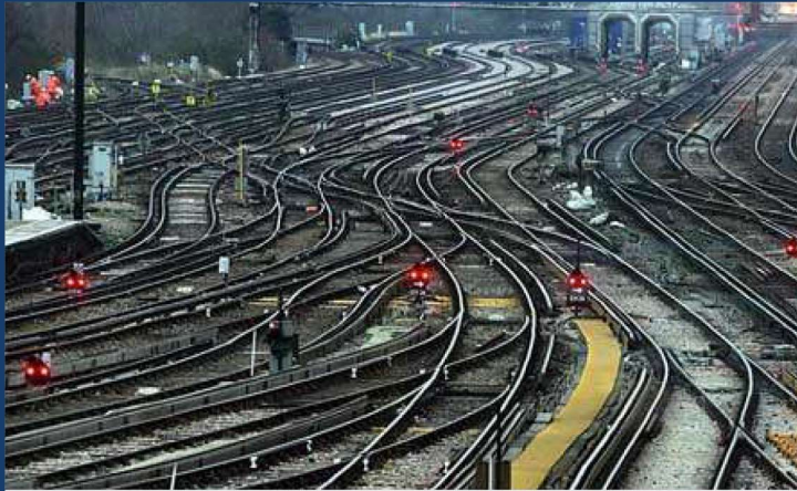
RAILWAYS & O.H.E FITTINGS