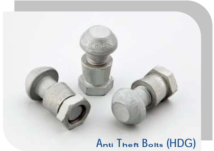
Anti Theft Bolts (HDG)