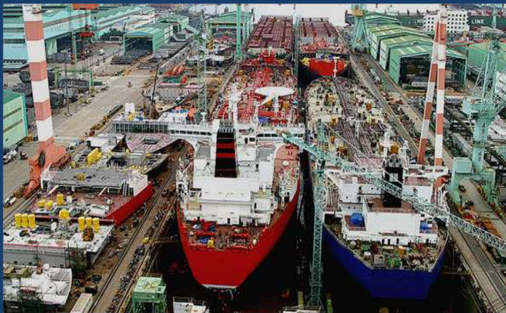
HEAVY ENGINEERING INDUSTRIES