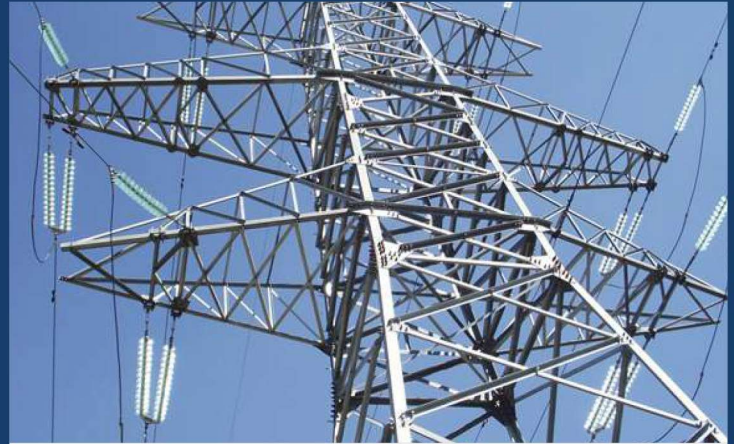
TRANSMISSION LINE TOWERS