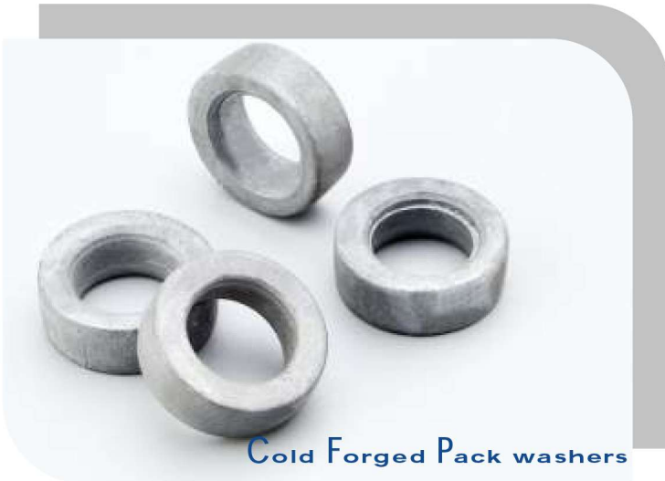
Cold Forged Pack washers