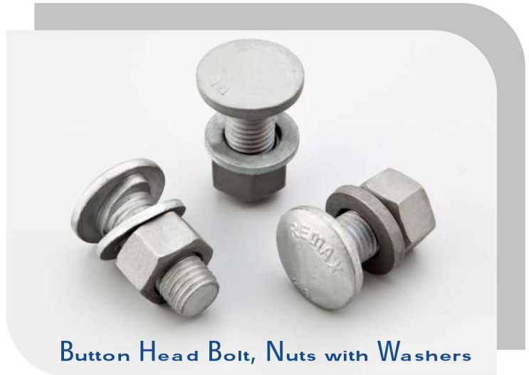
Button Head Bolt, Nuts with Washers