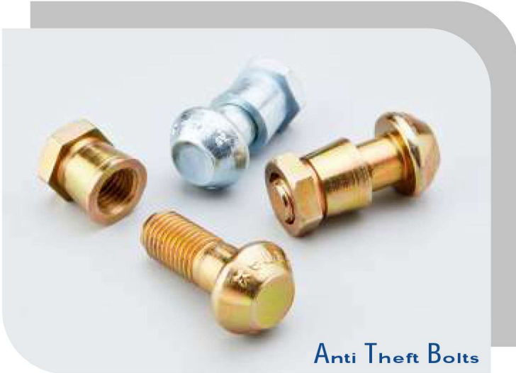
Anti Theft Bolts